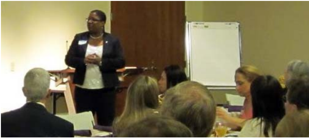
BWFC MEMBERS ATTEND OUR ANNUAL "PROFESSIONAL LEADERSHIP IN MEDICINE & SCIENCE CONFERENCE."