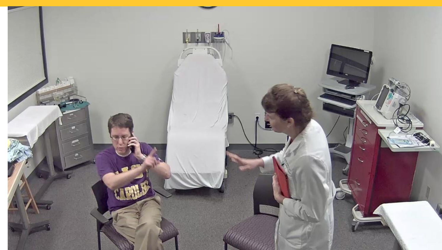
Figure 1. Still image from video